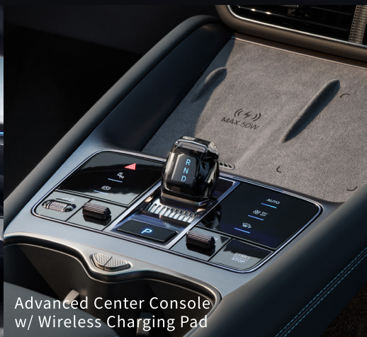
Advanced Center Console w/ Wireless Charging Pad