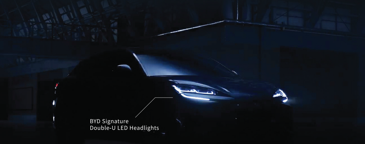
BYD Signature Double-U LED Headlights