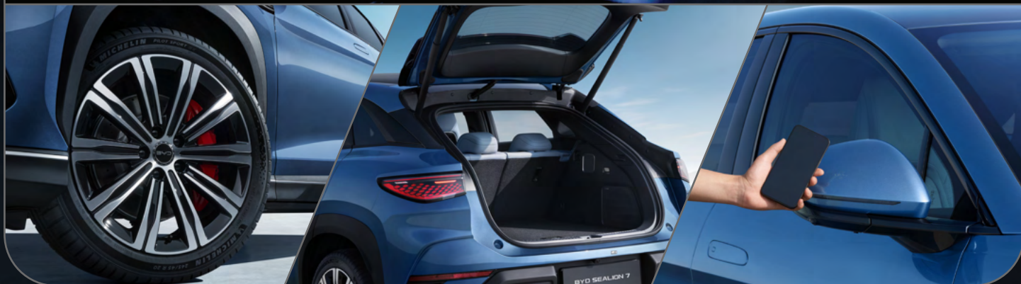
19-Inch Alloy Wheels