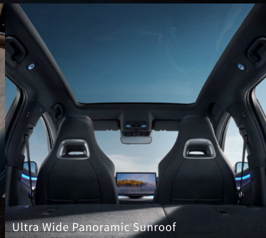
Ultra Wide Panoramic Sunroof