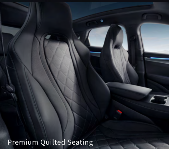
Premium Quilted Seating

BYD SEALION 7 embodies a bold vision of electric mobility with its sleek lines and commanding stance. Every detail, from the fluid design to the thoughtfully spacious interior, is designed to elevate the driving experience. Merging cutting-edge technology with a refined sense of style, the BYD SEALION 7 delivers not just performance, but an unmatched journey that redefines what an electric SUV can be.