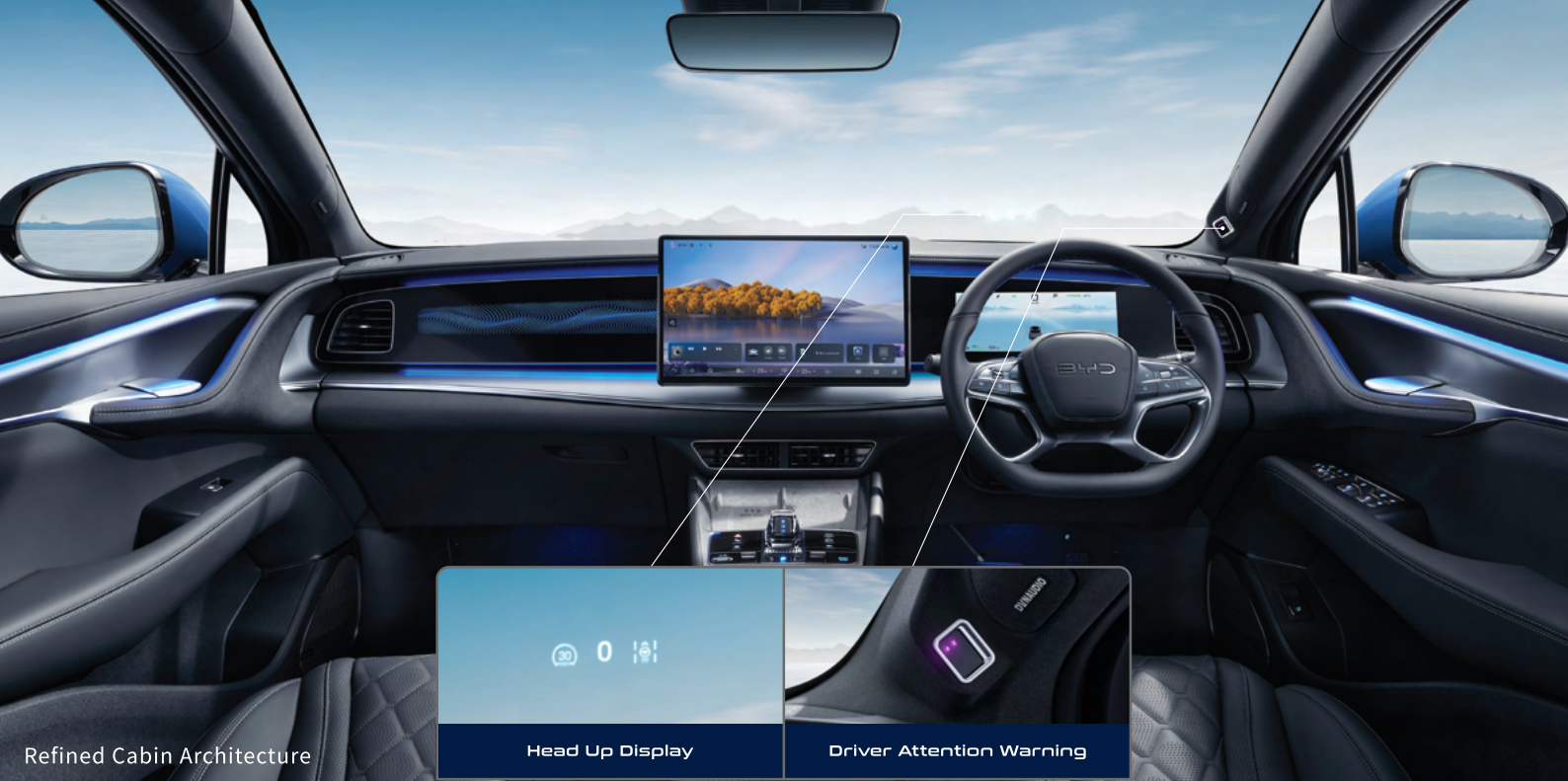
Refined Cabin Architecture