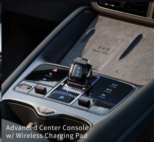
Advanced Center Console w/ Wireless Charging Pad