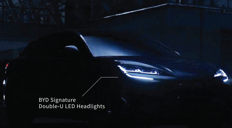
BYD Signature Double-U LED Headlights