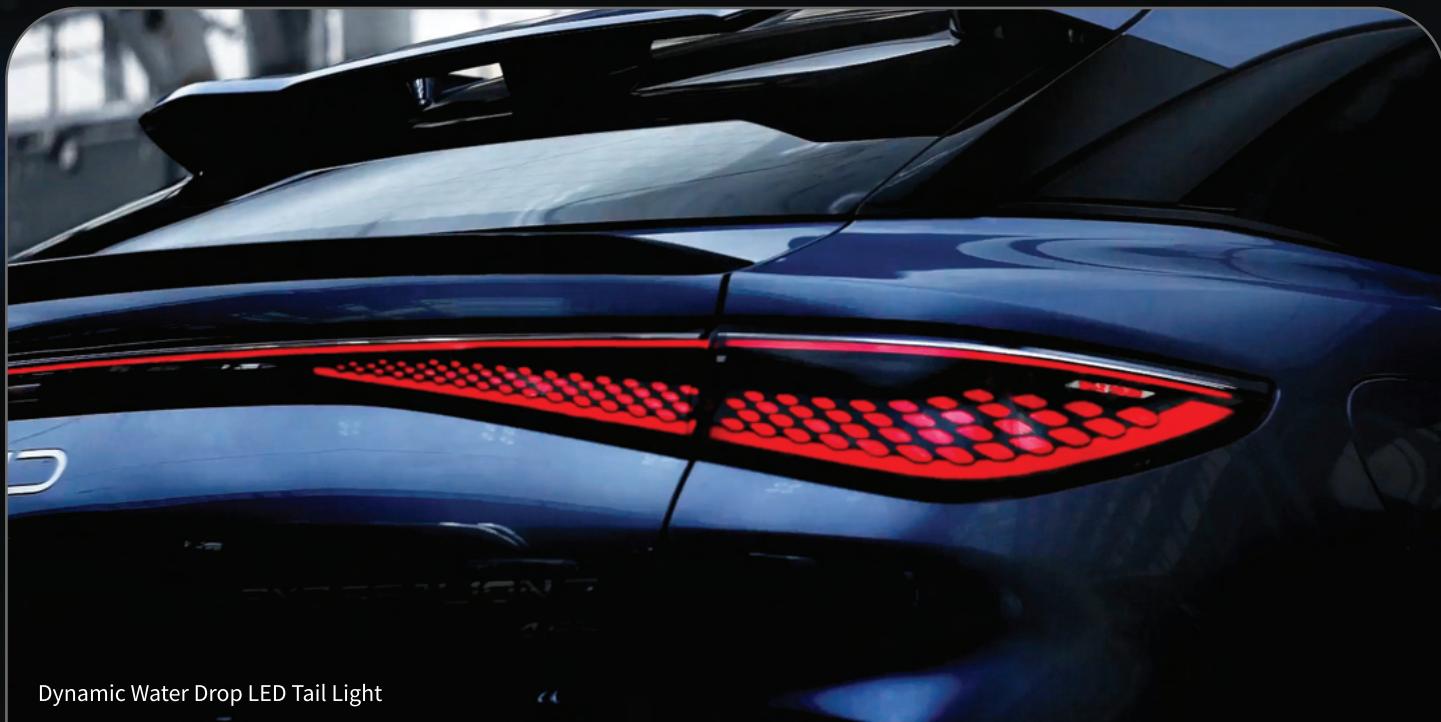
Dynamic Water Drop LED Tail Light